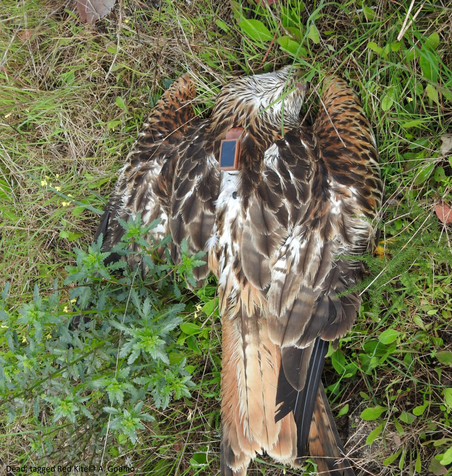
Dead, tagged Red Kite